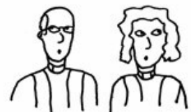
WHEN NOBODY HAS A CLUE WHAT IS SUPPOSED TO HAPPEN NEXT