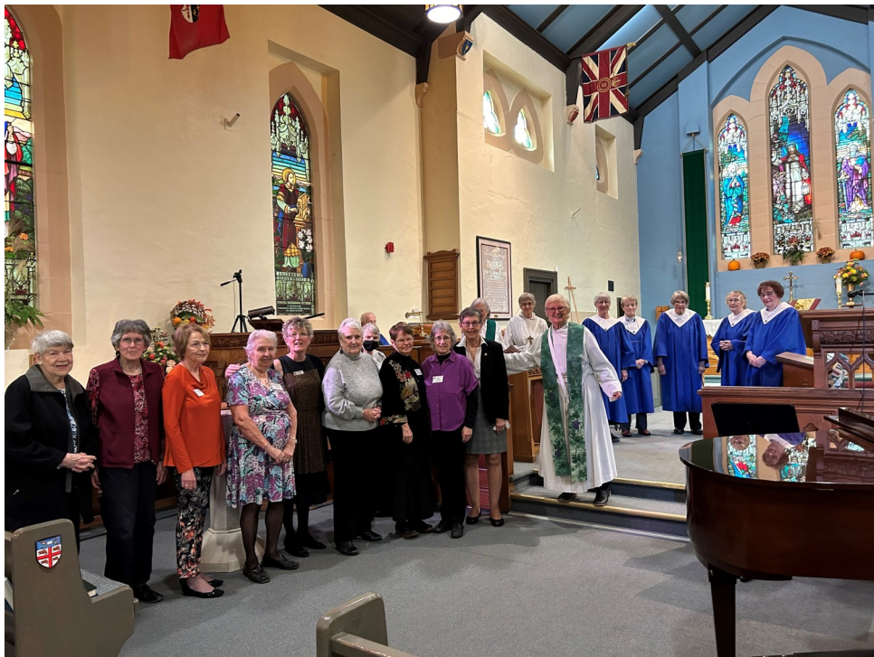
CELEBRATING THE ACW AT ST. PAUL'S October 15, 2023