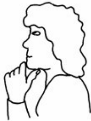
AT MOMENTS WHEN PONDERING IS EXPECTED

THIS IS ONE OF THE CENTRAL ELEMENTS OF A CHURCH SERVICE. WE OBSERVE A LITURGICAL PAUSE AT THE FOLLOWING POINTS: