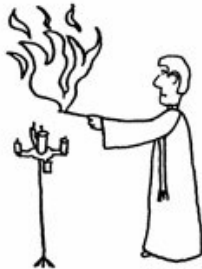
WHEN AN EASTER FIRE OR ADVENT CANDLE REFUSES TO LIGHT