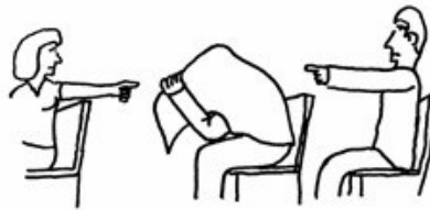
WHEN NO-ONE WILL ADMIT TO BEING THE PERSON DOWN TO LEAD THE INTERCESSIONS