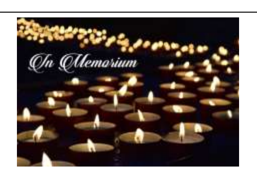
Service for Chuck Page Sat. Mar. 9, 2024