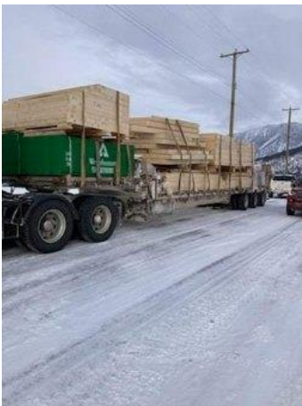
Here is a photo of the first house package arriving in Lytton on January 18/24. Concrete is poured for the first house and this is the package for the second one.