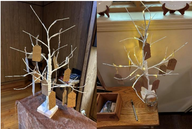
Prayer Trees in Lillooet at St. Andrew's and St. Mary's and in Lytton at St. Barnabas