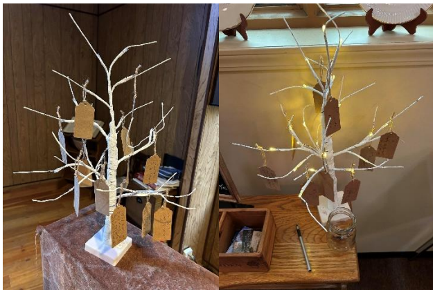
Prayer Trees in Lillooet at St. Andrew's and St. Mary's and in Lytton at St. Barnabas