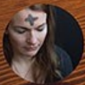
Ash Wednesday GUIDED TO FORGIVENESS