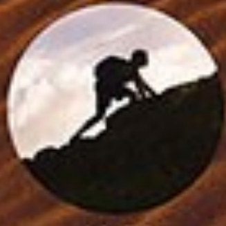
Week 5 GUIDED TO PERSEVERANCE