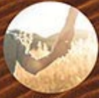
Week 4 GUIDED TO TRUST