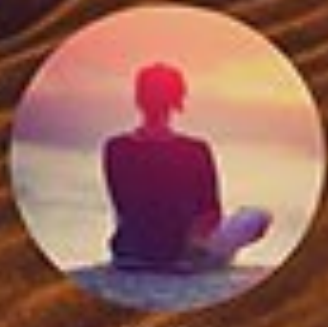
Week 3 GUIDED TO PEACE