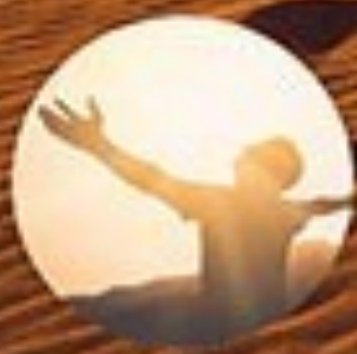
Week 1 GUIDED TO HOPE