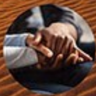
Week 2 GUIDED TO LOVE