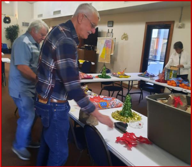
The Rugensteins and Grages pack the Christmas goody bags for the congregation.