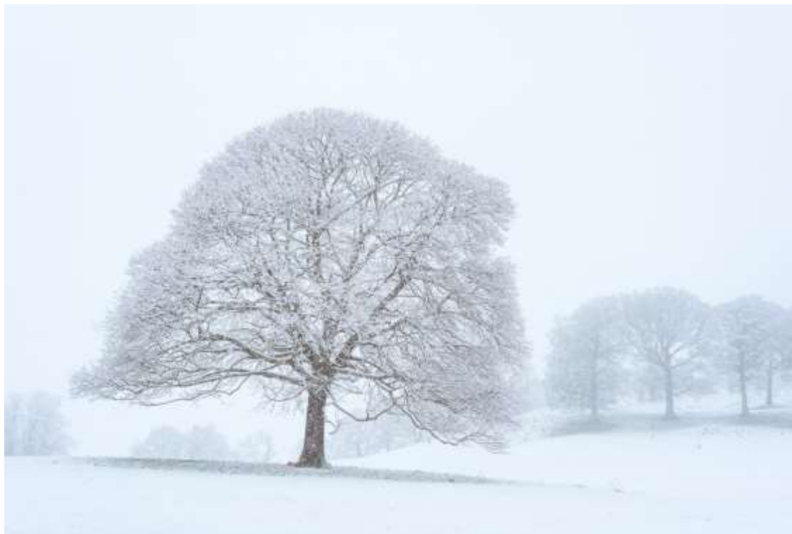
Click and Learn Photography-unsplash