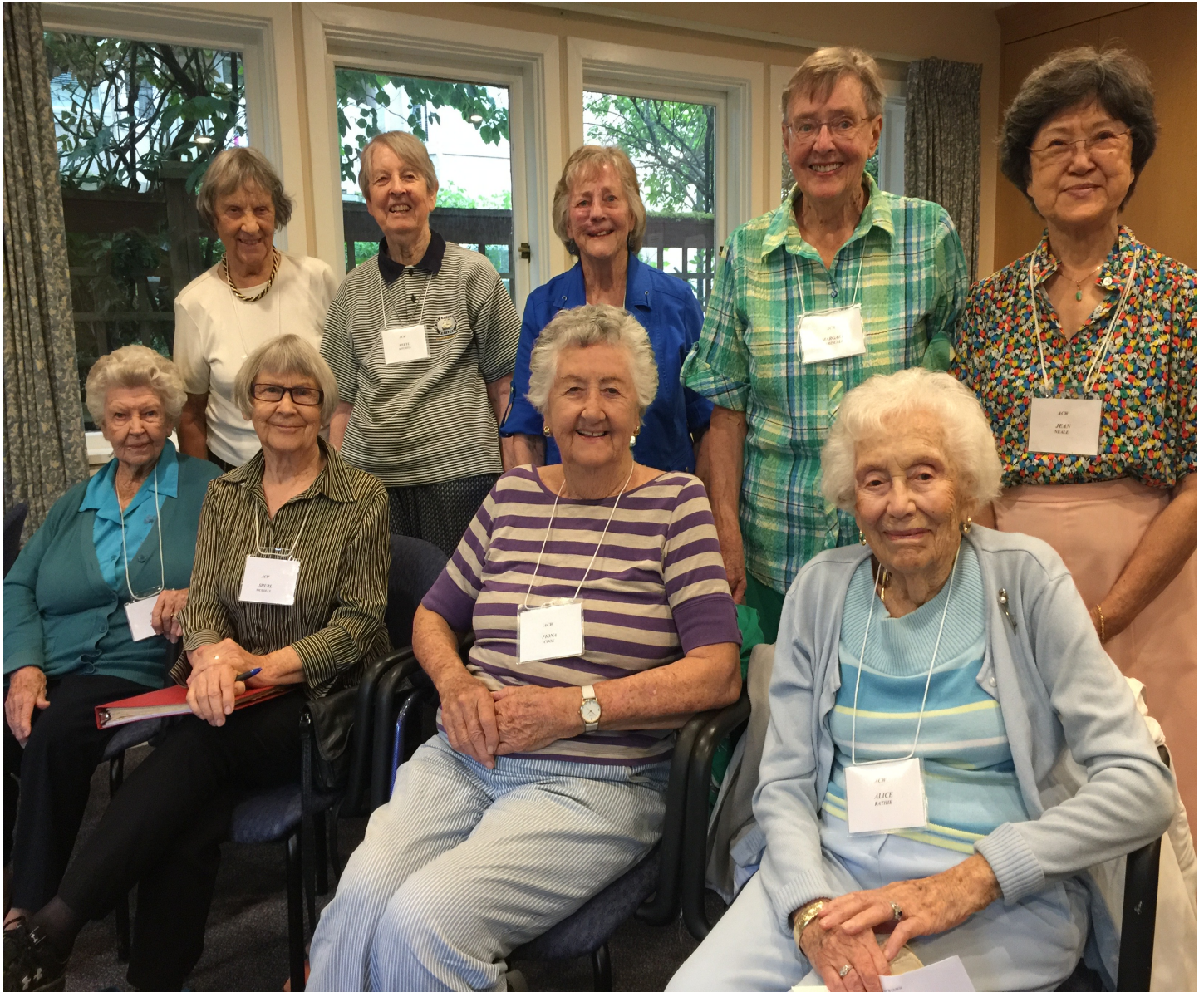
of the Anglican Church Women (A.C.W.) at St. Mary's Kerrisdale in Vancouver. The group's first donation to the Cdn. Friends/CCRS was in May of 2011. Since that time the group has made 10 more donations.