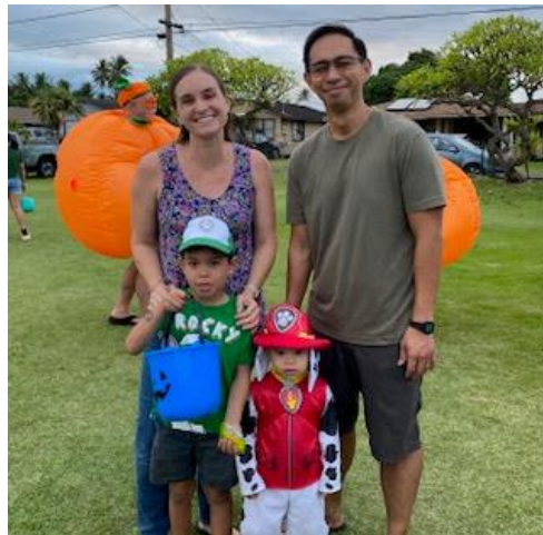
A few early trick or treaters.....