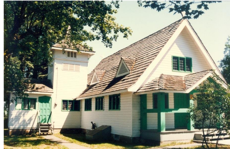
St. Oswald's, Port Kells