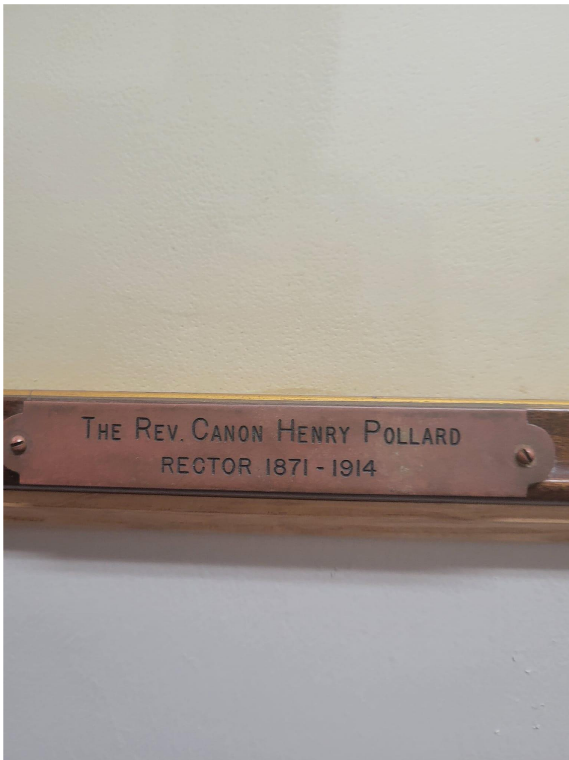
From Photo displayed at Sr John the Evangelist Church in Ottawa.