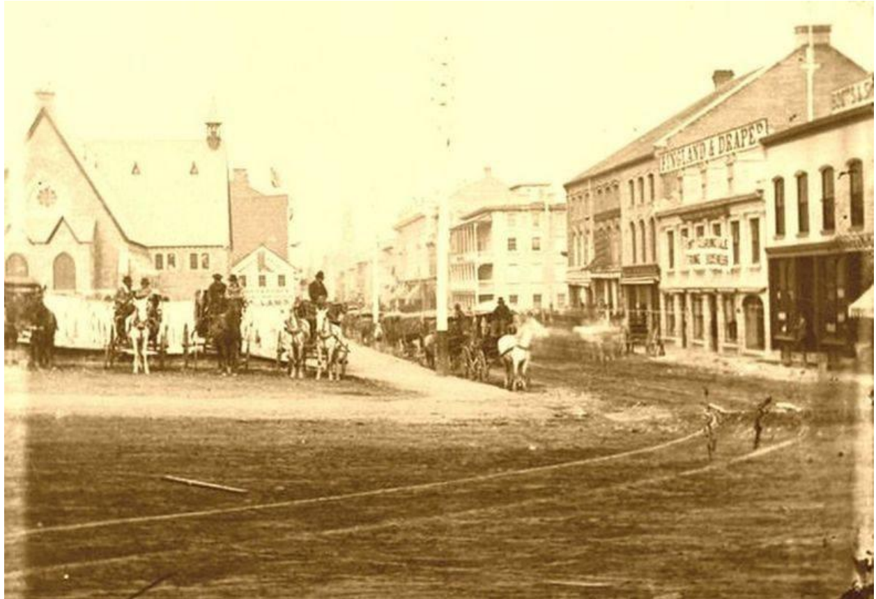
Ottawa - 1875 July - Looking North on Sussex from Rideau Street. St John the Evangelist Church at its original location on Sussex is to the left behind the horses and carriage.