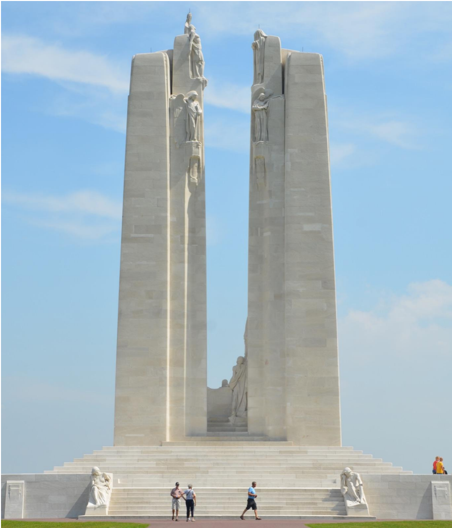
Vimy Ridge (Jim Harbell)