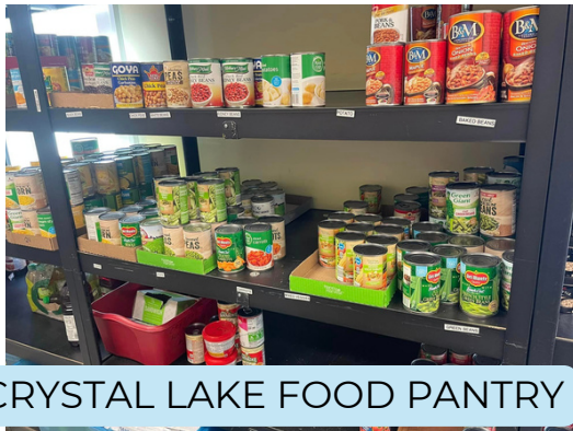
CRYSTAL LAKE FOOD PANTRY

Ellington Human Services: The Ellington Human Services Food Pantry is located at the Human Services Department, 31 Arbor Way. Food is distributed on a monthly basis. You must be an Ellington resident and meet the income requirements in order to receive food from the Food Pantry. Visit https://www.ellington-ct.gov/departments-and-services/human-services/food-bank