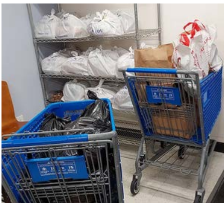
CORNERSTONE FOOD CUPBOARD

The Hockanum Valley Community Council Food Pantry: "Available to anyone struggling with Food Insecurity regardless of residency since 1970." 29 Naek Road, Suite 5a, Vernon For more information visit www.hvcchelps.org/pantry .