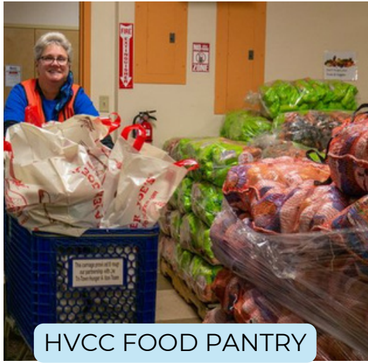
HVCC FOOD PANTRY

The need for food assistance continues to grow and they witness the struggles of each food pantry that serves our neighbors in and around Ellington. Thank you for your help and please continue to support the Grocery Cart Ministry and know you are helping your neighbors when you do so.