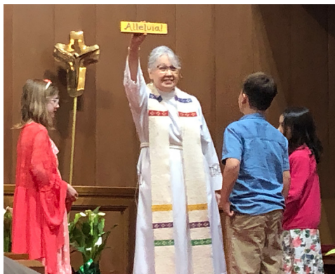
Easter Sunday at Christ the King West Campus