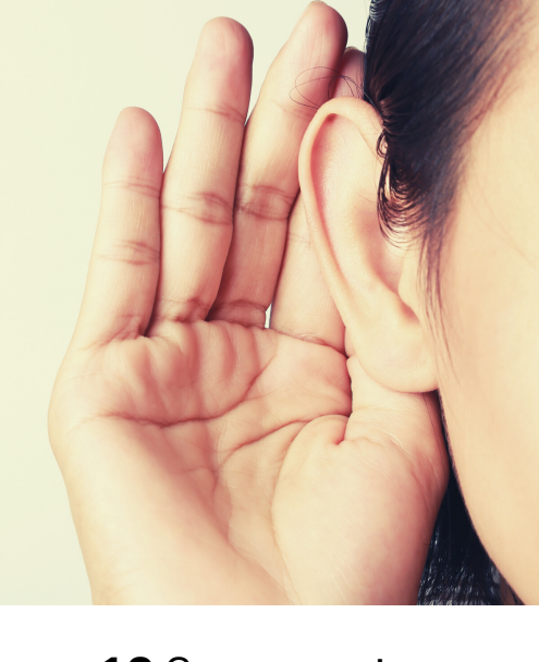
August 19 Congregations Discerning the Call to Future Leadership & Ministry

August 18 Discerning the Call to Service in the Church