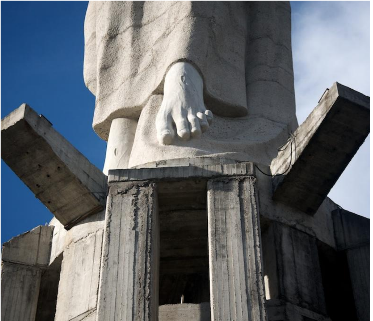
'Christ Ascending' sculpture, El Picacho City Park, Tegucigalpa, Honduras