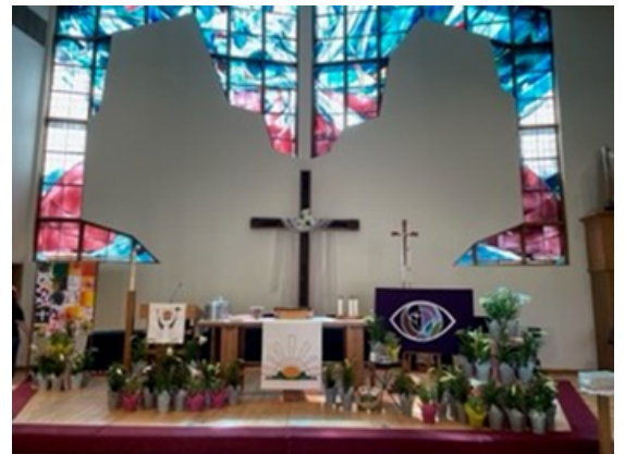
Easter Sunday 2023