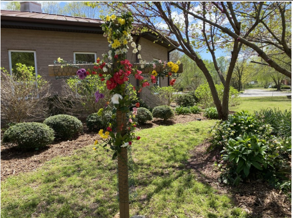
Easter Vigil at Grace Episcopal in Yorktown and our beautiful Easter cross