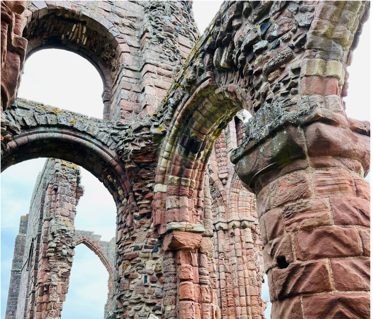
The Lindisfarne Priory on Holy Island in Northeast England