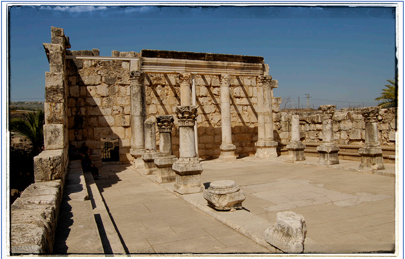
The Synagogue at Capernaum

“And truly Jesus did many other signs in the presence of His disciples, which are not written in this book; but these are written that you may believe that Jesus is the Christ, the Son of God, and that believing you may have life in His name.” (John 20:30–31)