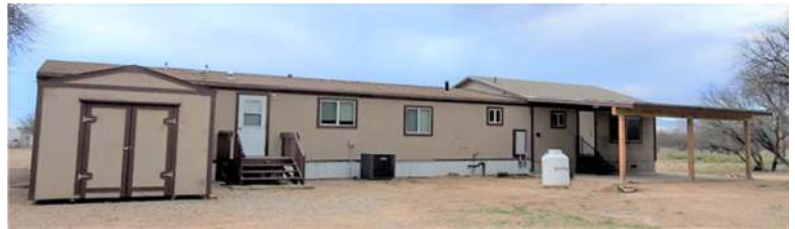
Now house parents will have dedicated space for their own family in addition to children needing temporary housing.