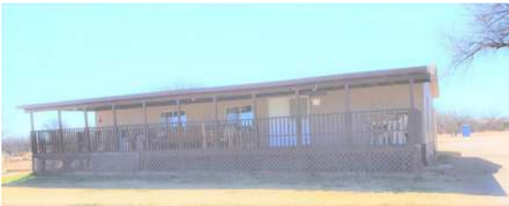
The work on the Palomino project began last year.