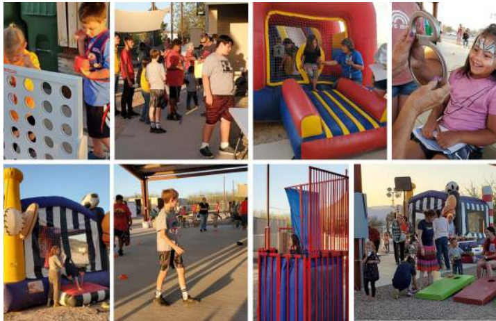
The Awana season came to a fun-filled end at the Carnival on April 26th.