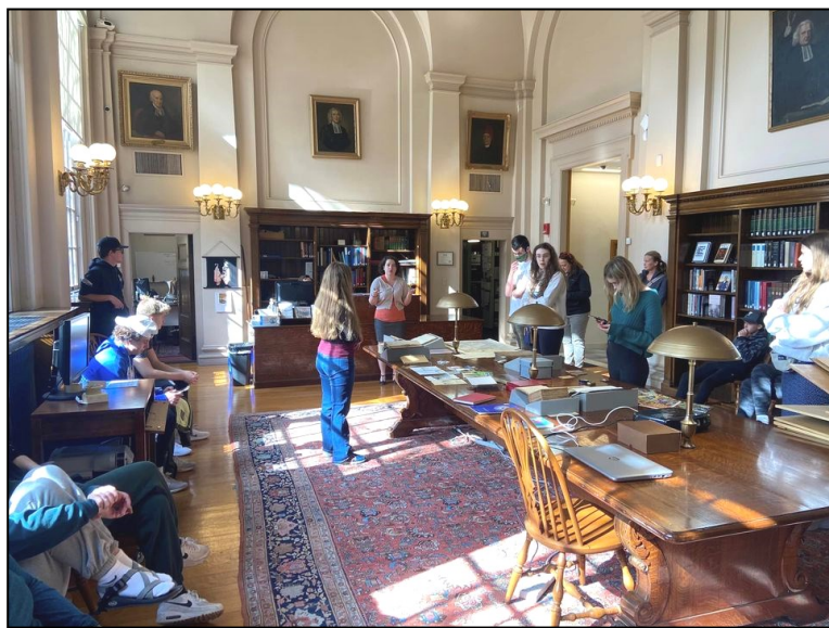
Learning about our church history at the Congregational Library