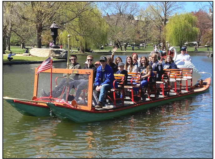
Taking a glide on the Swan Boats