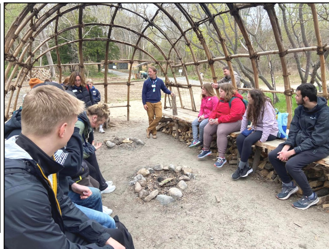
Learning about how the Wampanoag people lived