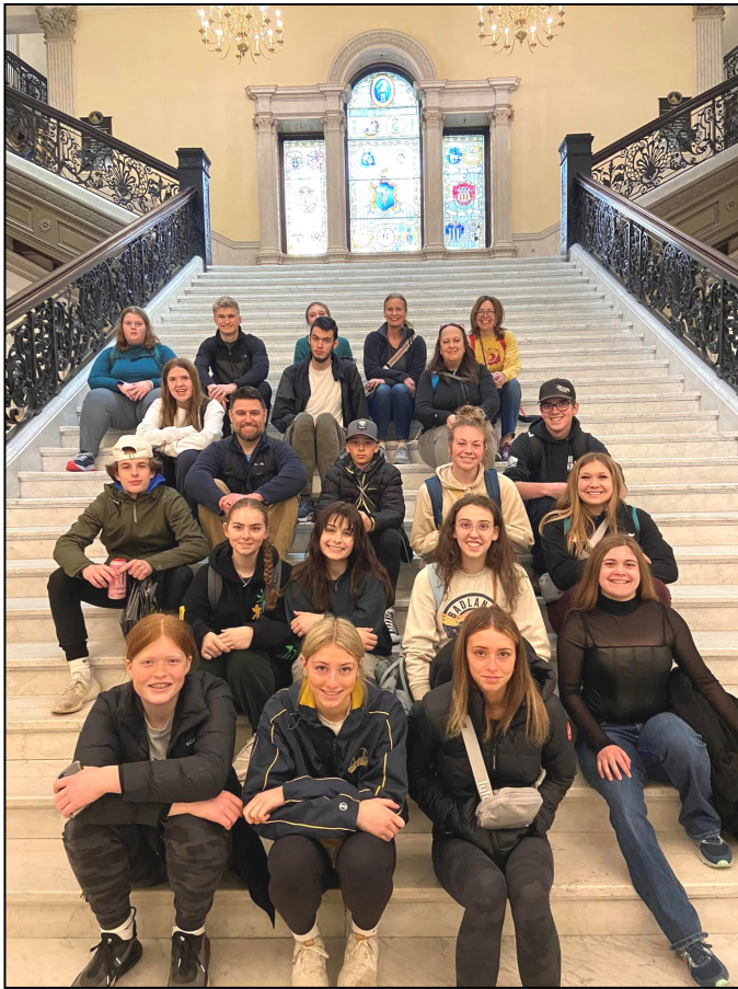
Our group on the steps at the state capital in Boston