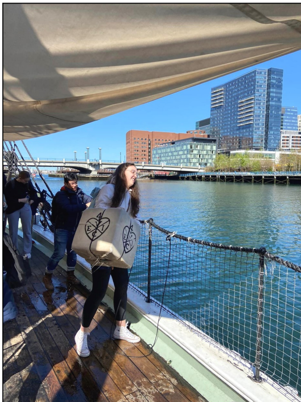
One of our group throwing tea into Boston Harbor (it comes back up)