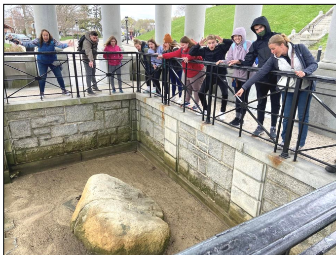
Number 5 on the 'Most Under Whelming Sites in America:' Plymouth Rock