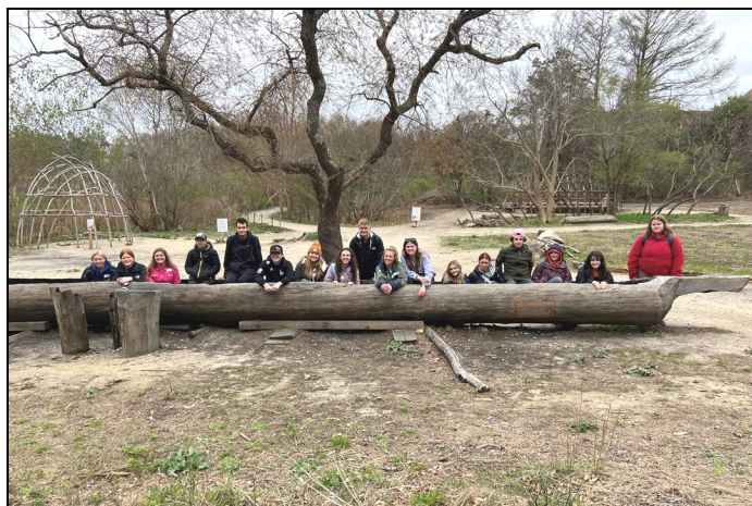
A mishoon (canoe) could be up to 40 feet long to harpoon whales!