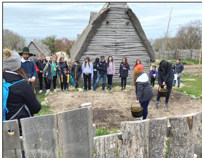
Talking to one of the Pilgrims