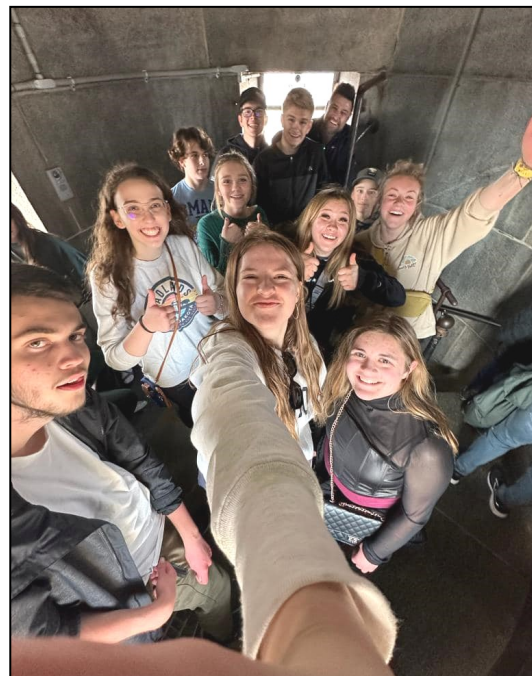
At the top of Bunker Hill after 294 steps