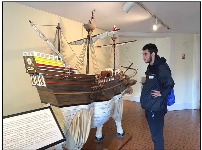
The MooFlower (get it?)