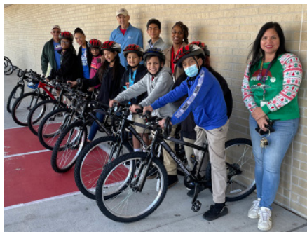
Freewheels volunteers delivered bikes to 5th- and 6th-graders at Mata Intermediate School in the Alief Independent School District in December.