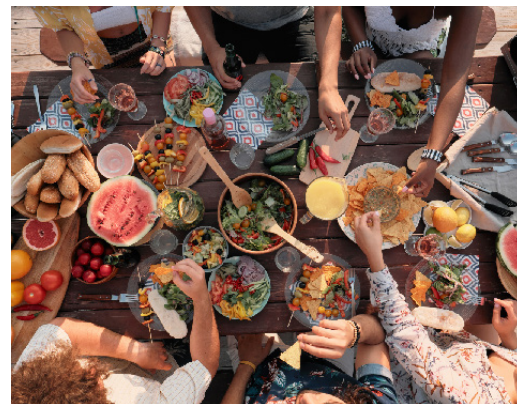
Table Talk, our theme for Lent 2023 will focus our prayerful attention on the Table, restoring the connection between Christ's Table and our own. Who sets at the Table? Who sits the Table? What is our Table etiquette? These and other questions will provide the bases for our

conversations over Lent's Forty Days at our Sunday services, forums, after service Lent lunches, and at Wednesday evening vespers.