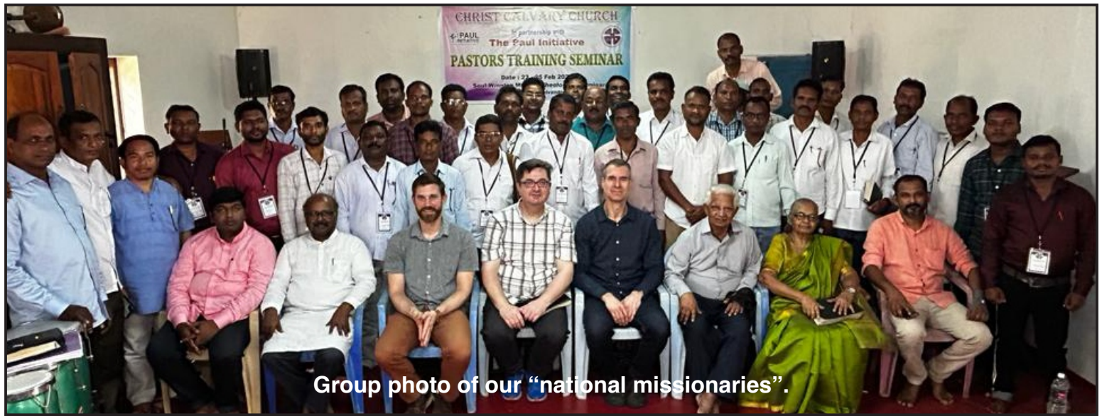
Group photo of our “national missionaries”.