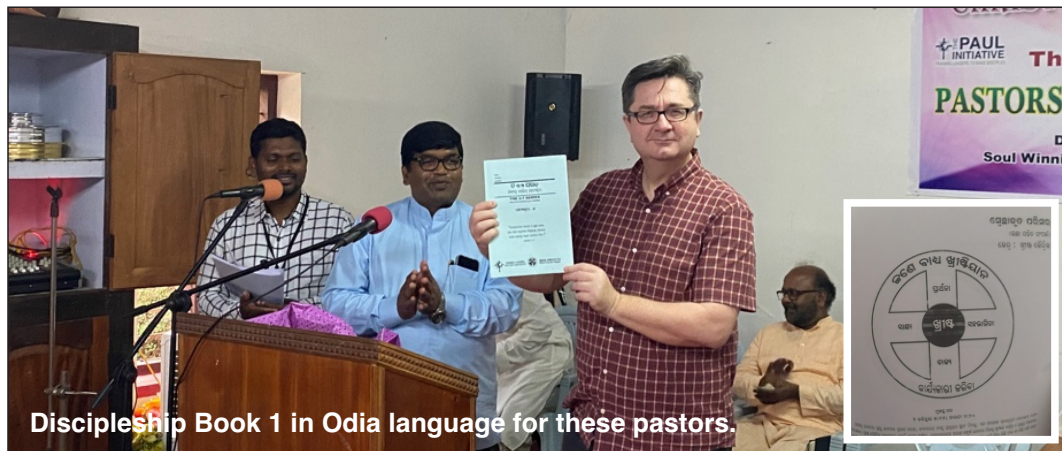
Discipleship Book 1 in Odia language for these pastors.