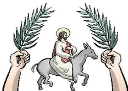
Palm/Passion Sunday April 2 - 9:30am

Procession of the Palms followed by a Dramatic Reading of the Passion