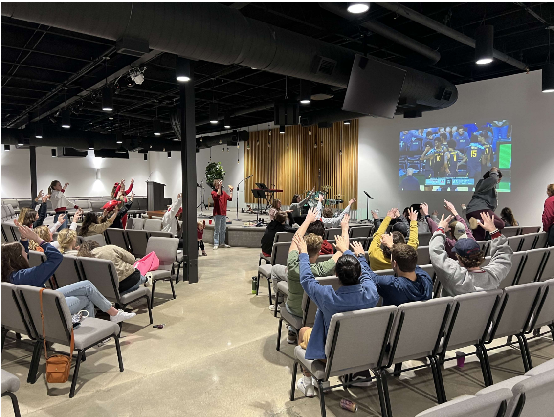
Watch party for Arkansas Basketball - we've been having a fun season!

The kingship of Jesus has always been questioned by the world and human hearts that want to be their own masters. And these students constantly hear the message from the outside world to live for themselves, follow their own hearts, and never look back. But Jesus tells a better story for how to make sense of who we are and what we should live for in this world. Please pray for Wednesday nights and for our students to see and love Jesus and to follow after him.