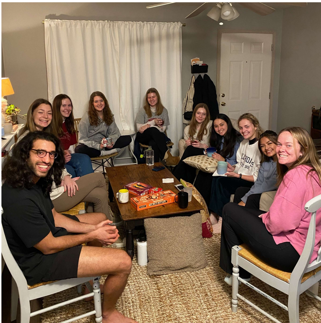
Student game night - always a hit!