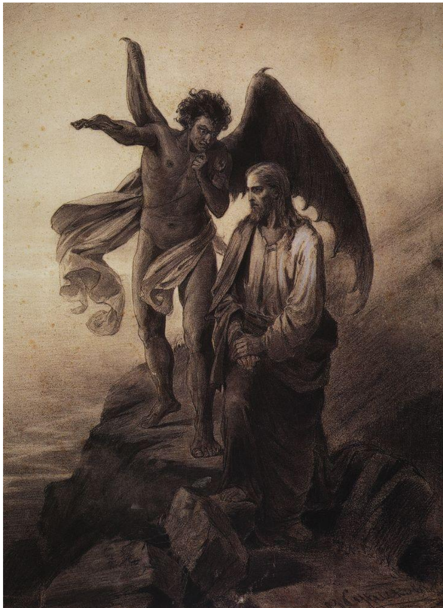
Temptation of Christ - Vasily Surikov - 1872 Public Domain

We are an inclusive and affirming parish; the sacraments of the church (baptism, communion and marriage) are available to all people on equal terms. Christ welcomes you, and so do we.