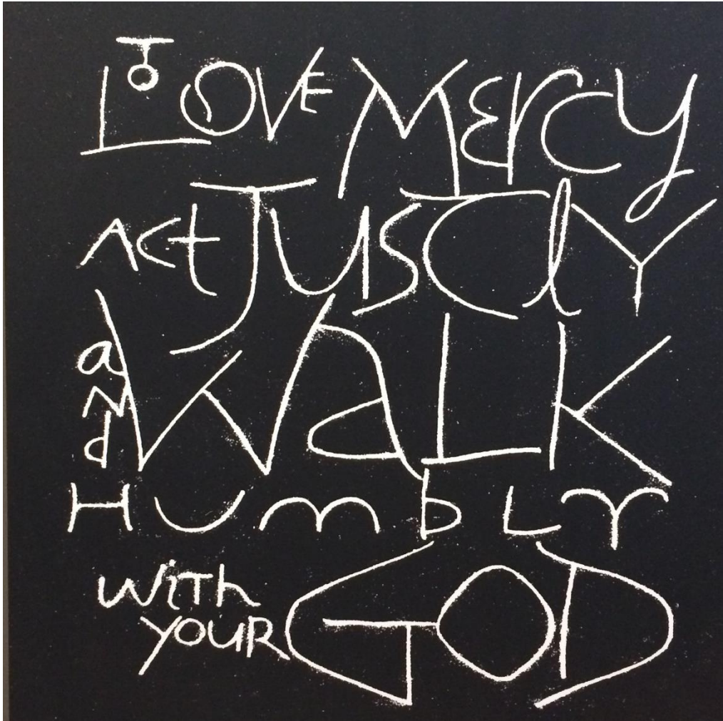
at the Abbey, Iona, Scotland