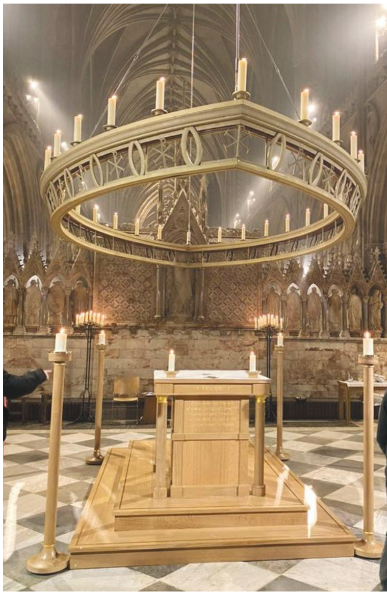
The shrine of St. Chad, at Lichfield Cathedral in England.

In witness to the community, St. Chad Catholic School from Birmingham brought many of the school children to the event. It was a sacred time and one that built relationships, friendships and faith.