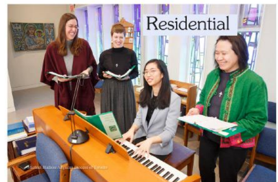
Application start & end (both programs): January 1, 2023 – May 15, 2023