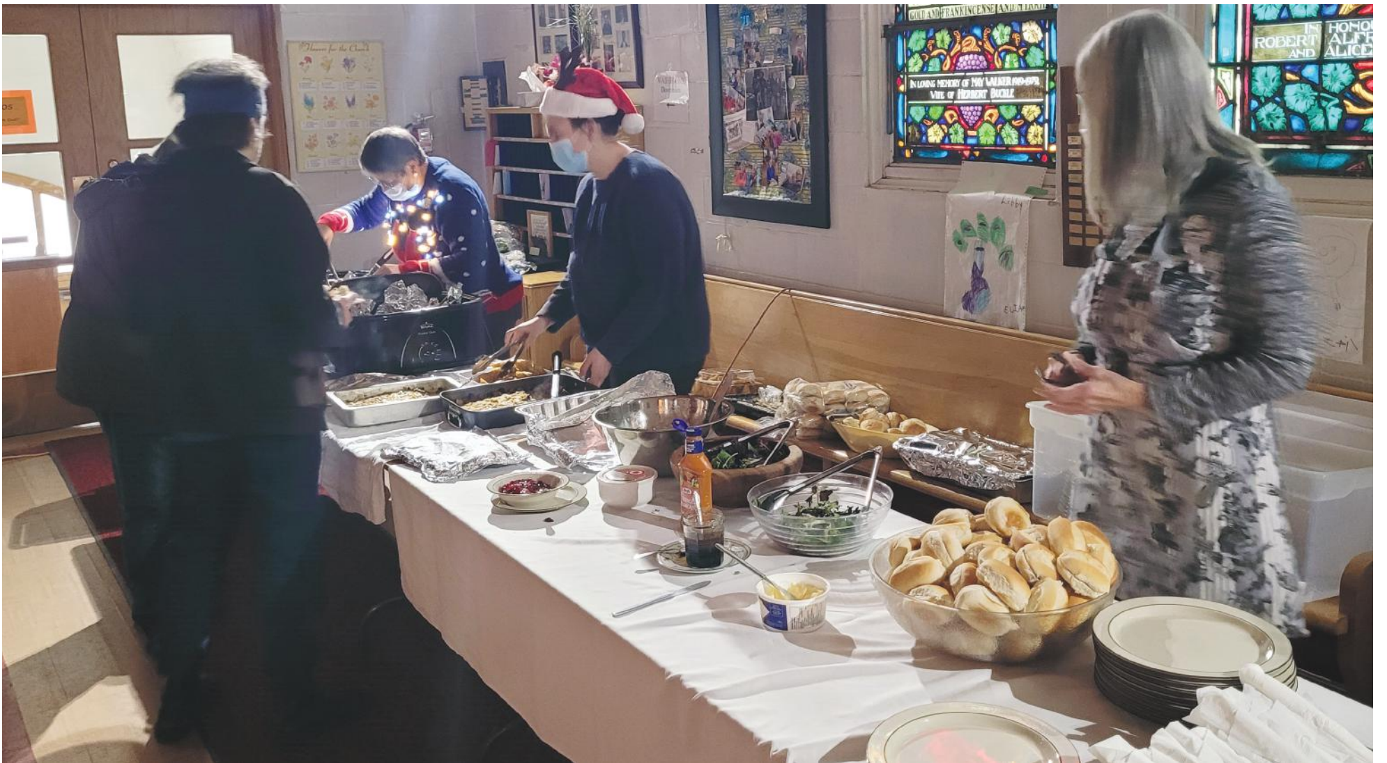
Volunteers celebrate Christmas by serving up a delicious hot lunch for their neighbours in the sanctuary of Christ Church, Saskatoon.