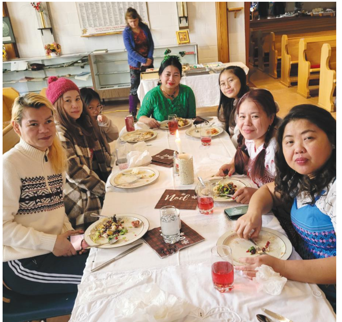
Some of the happy attendees at the Christ Church Christmas Lunch.