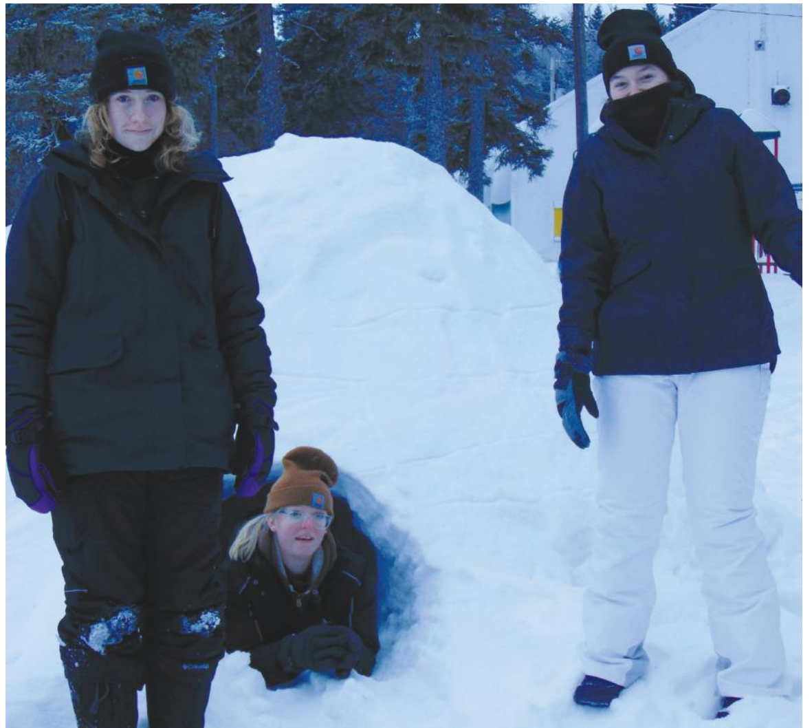
Youths dig out a quinzee they built while attending an Advent-themed retreat at Christopher Lake.

On Sunday they went to St. Christopher's Church and returned to camp for lunch and then to clean up. The venue is a large building with a common room with a big fireplace. The retreat was a laid-back affair in a serene comfortable setting and the kids will likely look forward to the next one.