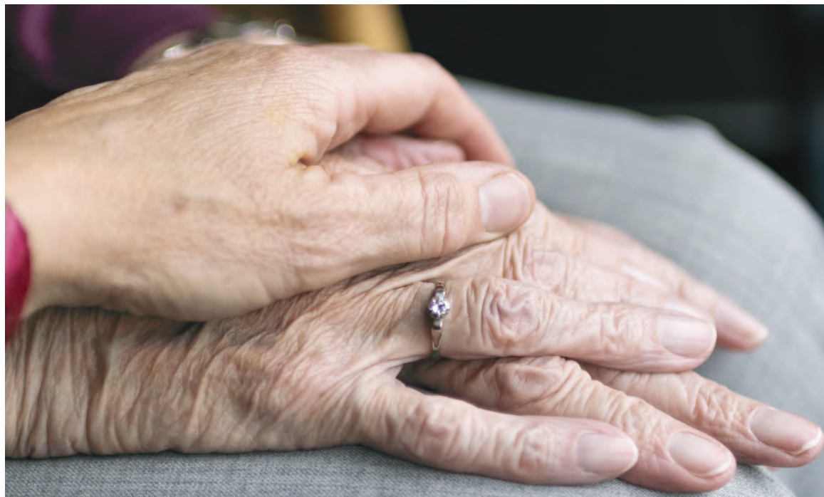
The only way to uphold human dignity is to work with our hands to alleviate others' suffering in every possible way, writes Rev. Brody Albers.

Surely on the one hand, it seems the humane thing to do. We want to limit human suffering as much as we can. Nobody wants to see their loved one go