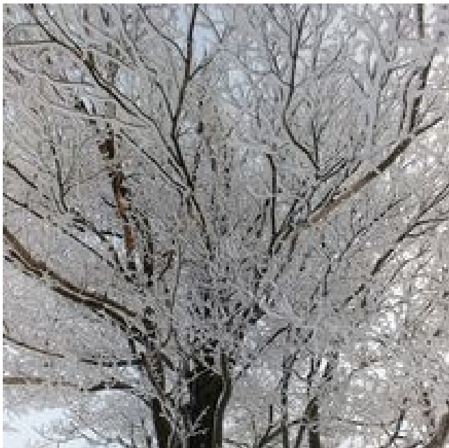
Frosted trees at church

*Please note: no Wednesday Lenten services will be recorded or available online.