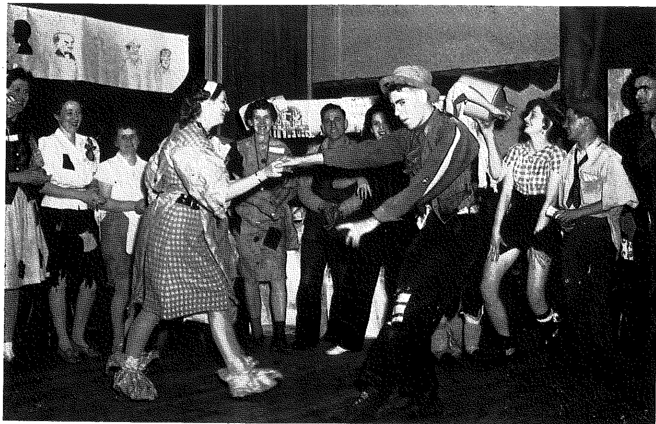
BRANCHES OF THE A.Y.P.A.