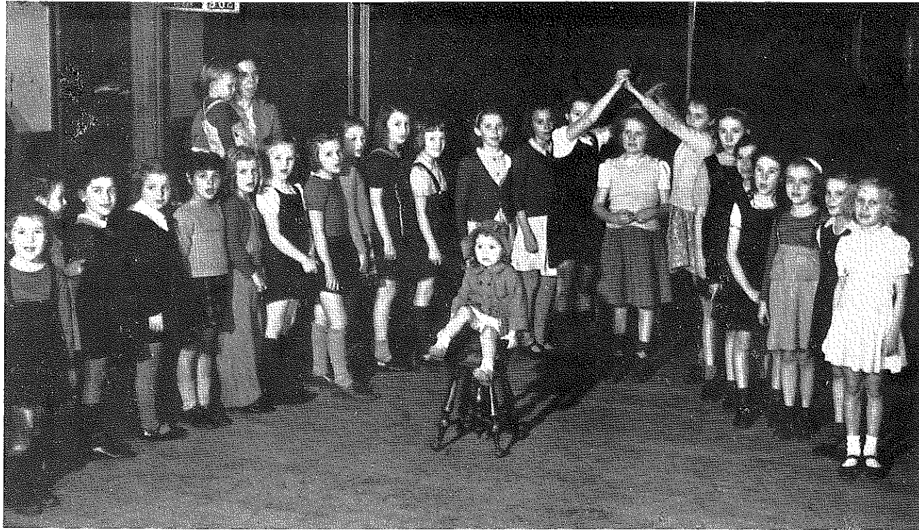
GIRLS' MID-WEEK ACTIVITIES