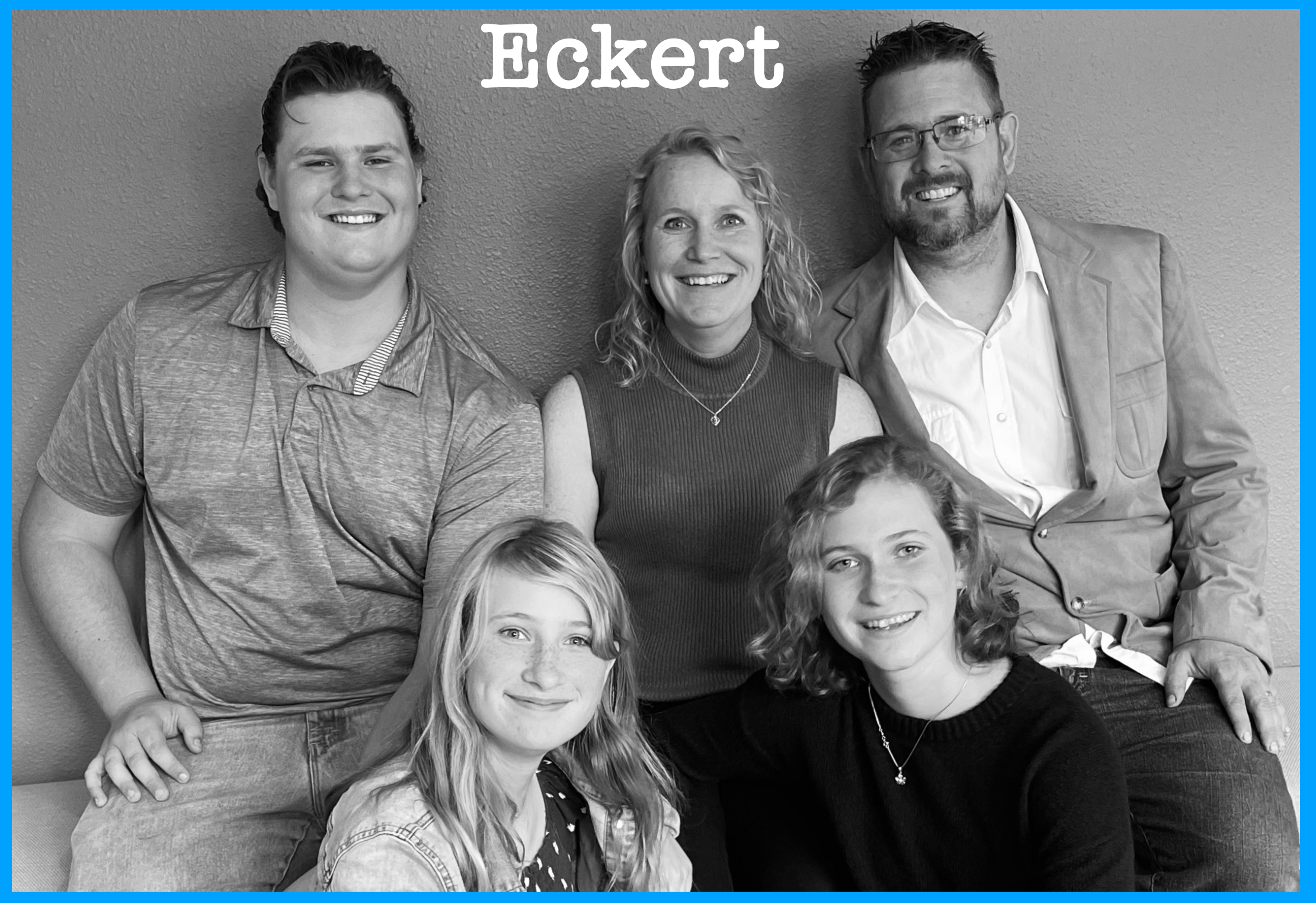
Missionaries to Asia Pacific