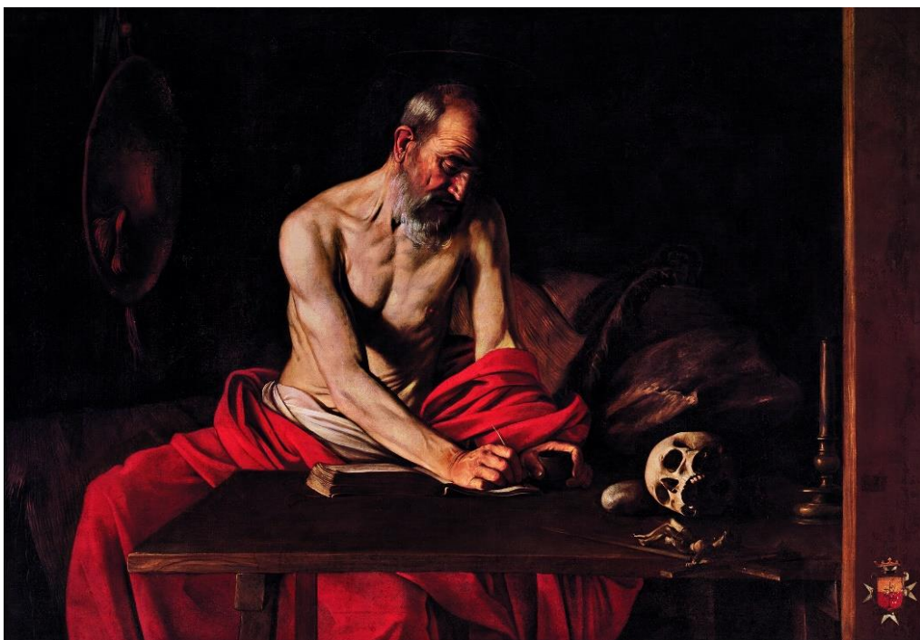
Michelangelo Merisi da Caravaggio: St Jerome, - 1607CE, St John's Co-Cathedral, Valletta, Malta

RESPONSE O God you searched us and known us, you know us completely