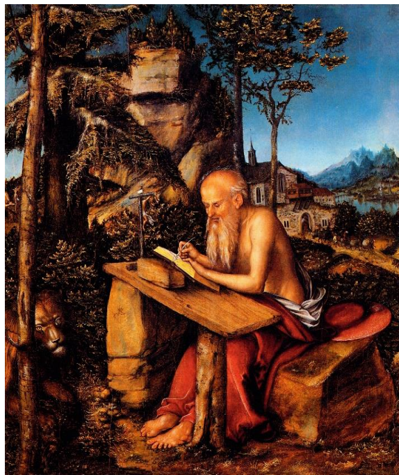
Lucas Cranach the Elder: “Saint Jerome in the Wilderness” c. 1515 CE

Theologian, translator of the Bible and Doctor of the Church, a man who was said to “...know all that there is to know”. While not converting to Christianity until his 20s in Rome, he readily absorbed the newly tolerated faith and undertook to live an aesthetic, almost Spartan lifestyle. His major contribution to history is his Latin translation of the Bible, correcting the imperfect Latin translation of the Greek New Testament books and, on moving to Bethlehem, learning and translating from Hebrew the Jewish texts now known as the Old Testament.