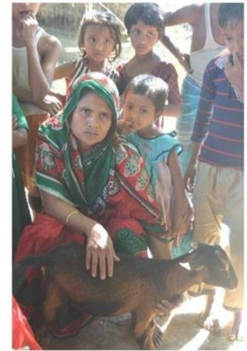
UBINIG - Bangladesh