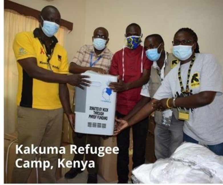
Kakuma Refugee Camp, Kenya