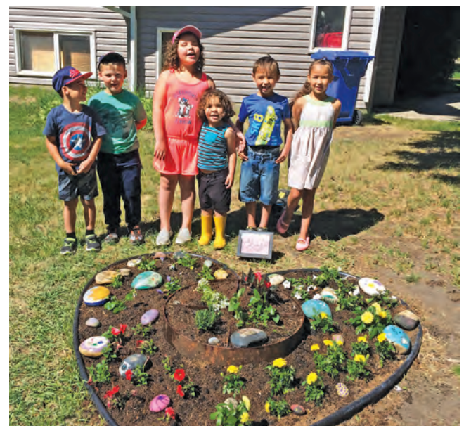
Children come every year to work on the Heart Garden.

the parishioners of Immanuel that the garden will be a place others in the community will see and be reminded of the children who went to residential schools. We honour the children by remembering them, and by remembering the role the church played in the operation of residential schools. It is our way to say we are sorry, and that we will never forget what happened.