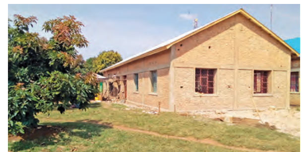
Exterior of new pediatric ward completed as of June 25.

Last year Edmonton diocese and PWRDF sponsored the construction of a maternity ward in Buyé, which serves approximately 5,400 women each year; providing a clean and safe space for deliveries and