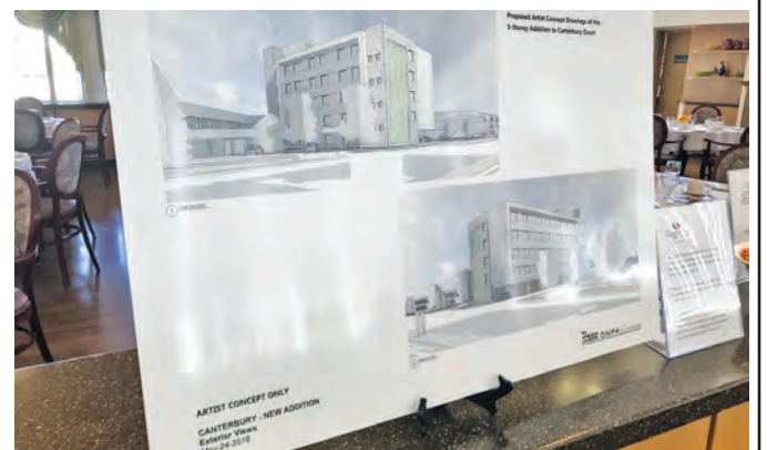
On display during the Brunch & Learn Series is an artist's concept of Canterbury Foundation's proposed residential hospice addition.

We hope to see you at our upcoming brunches on September 16 and November 11. We will share more details, specifically about our Residential Hospice project! For more information, please call 780-930-3747.