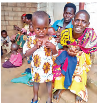
Family arriving at Burundi hospital.