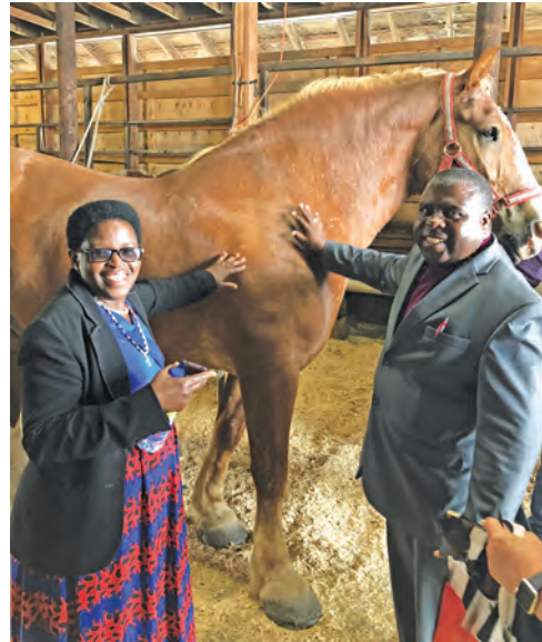
Above: Petting Clydesdales at Vermilion Fair. Below: An infectious smile over mini-doughnuts.