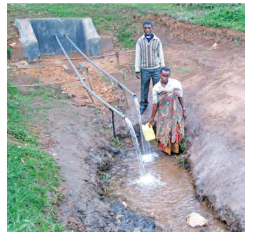
Villagers collect clean natural spring water filtered through pipes.