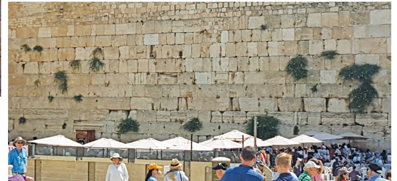
Day One: the Western Wall remembering Anna the prophetess (Luke 2:36-38) and the woman caught in adultery (John 8:1-11).

Pilgrimage reflections continued next page.