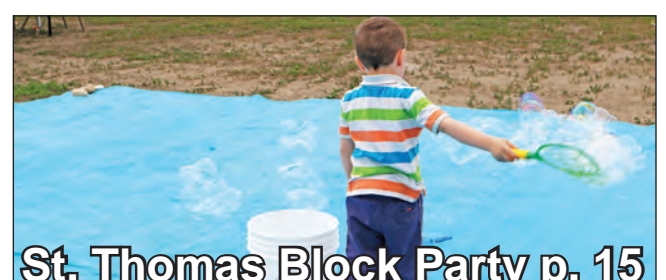
St. Thomas Block Party p. 15