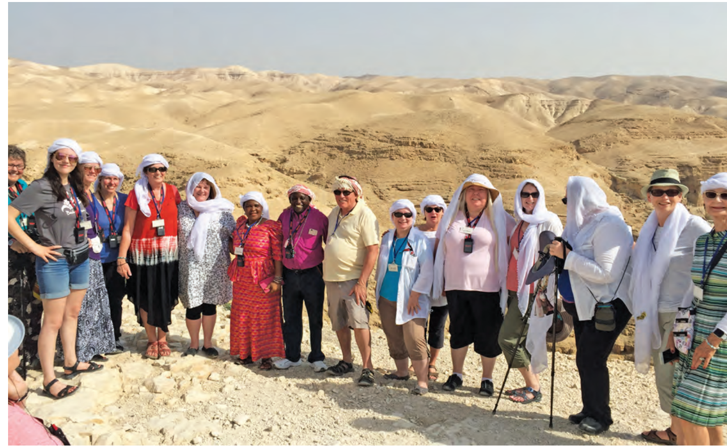
Participants in the Women of the Bible course gather in the Judean wilderness on Day Three with a focus on vocation.