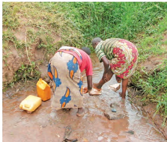
Women in Kirundo province collecting dirty water from natural springs.