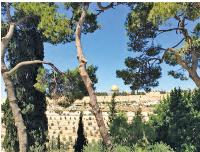
Looking out over Jerusalem from the church of Mary Magdalene.

I sought and found signs of my Teacher in fallen twigs laid out in a perfect cross, a flower