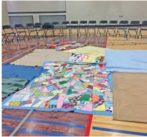
The Bashaw school gym waits, prepared for the KAIROS Blanket Exercise.