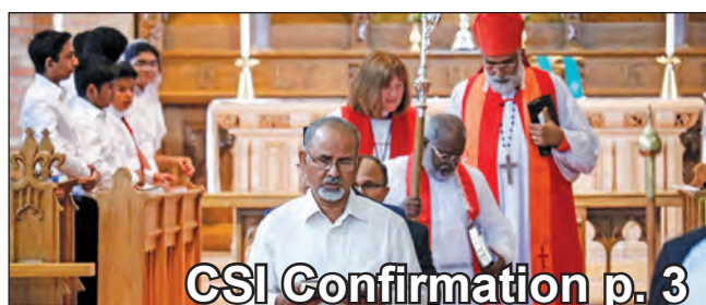
CSI Confirmation p. 3