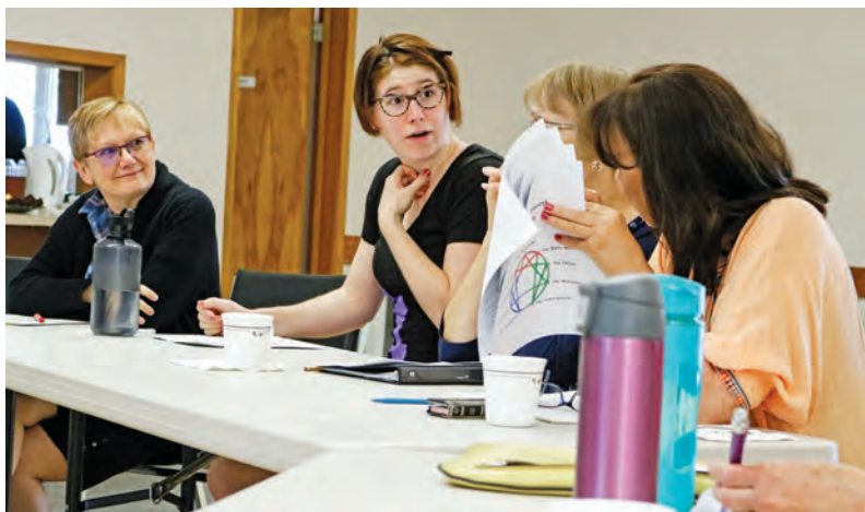
Participants from St. George, Fort Saskatchewan and St. Luke, Edmonton take in the ID Enneagram workshop.