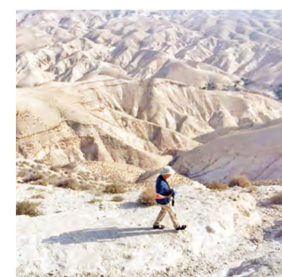
Above: Founded in the 5th century, the Monastery of St. George of Chozibo is carved into the cliffs of the Wadi Qelt, a deep ravine cutting through the Judean desert between Jericho and Jerusalem. Left: Participants were invited to a time of silence and solitude in the Judean wilderness.