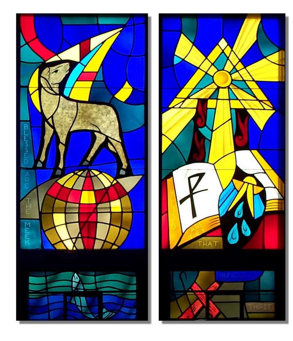
Blessed are the meek, for they will inherit the earth.

Blessed are those who hunger and thirst for righteousness for they will be filled.