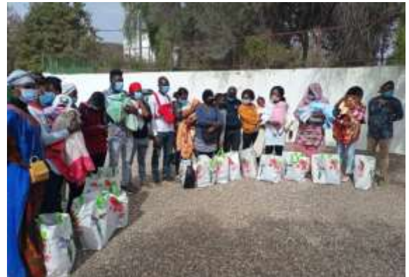
Food baskets are distributed in Agadir, Morocco

Although we are very aware of refugees fleeing the war in Ukraine these days, there are situations all over the world which force people to leave their home country.