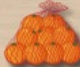
NET OR MESH PRODUCE BAGS