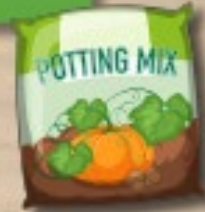
MULCH OR SOIL BAGS