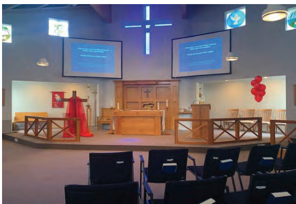
Photo taken on Pentecost Sunday