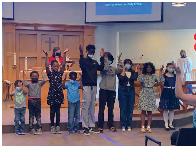
Sunday School signing the Lord's Prayer