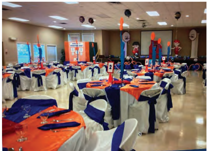
Filipino 7th Birthday Party

St. Matthias has one of the largest Anglican church halls in the city allowing us to host larger-sized gatherings, like Diocesan Synod and ACW meetings. Parishioners and visitors to our church home are impressed with the large and well-equipped multi-purpose hall, in addition to the center stage and adjacent commercial kitchen.