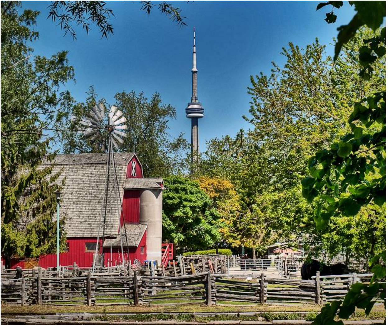
The Farm - Toronto Islands