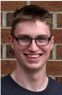
Cayman Turn RUNNING CREW