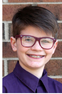
Ryder Scott CARPET