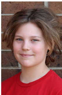
Fox Steinhauer FOOTSTOOL