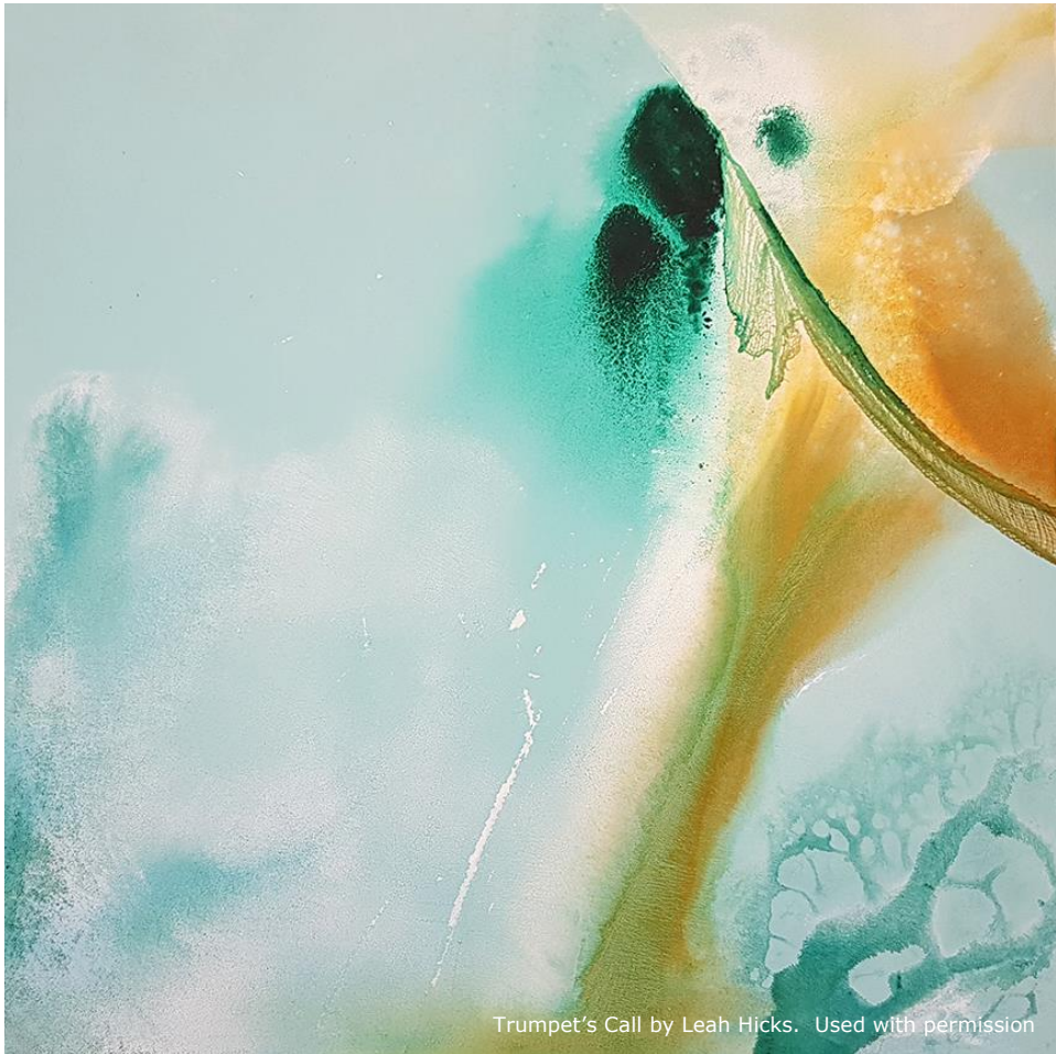
Trumpet's Call by Leah Hicks. Used with permission

Diocese of Ottawa • Anglican Church of Canada