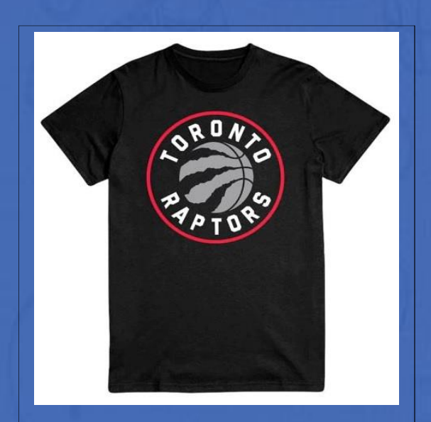
Cotton Crew Tee, 100% soft cotton jersey material, officially licensed by the NBA.