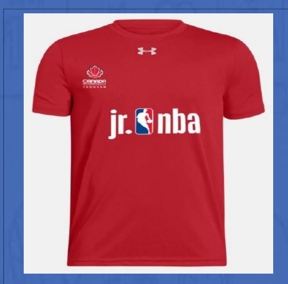
UA Tech-Fabric, quick drying, 100% Polyester, officially licensed by the NBA.