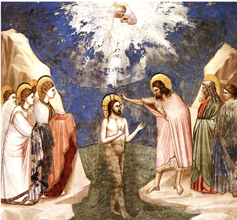
Baptism of Christ

Presider: Go in peace to live a life of service People: Thanks be to God.