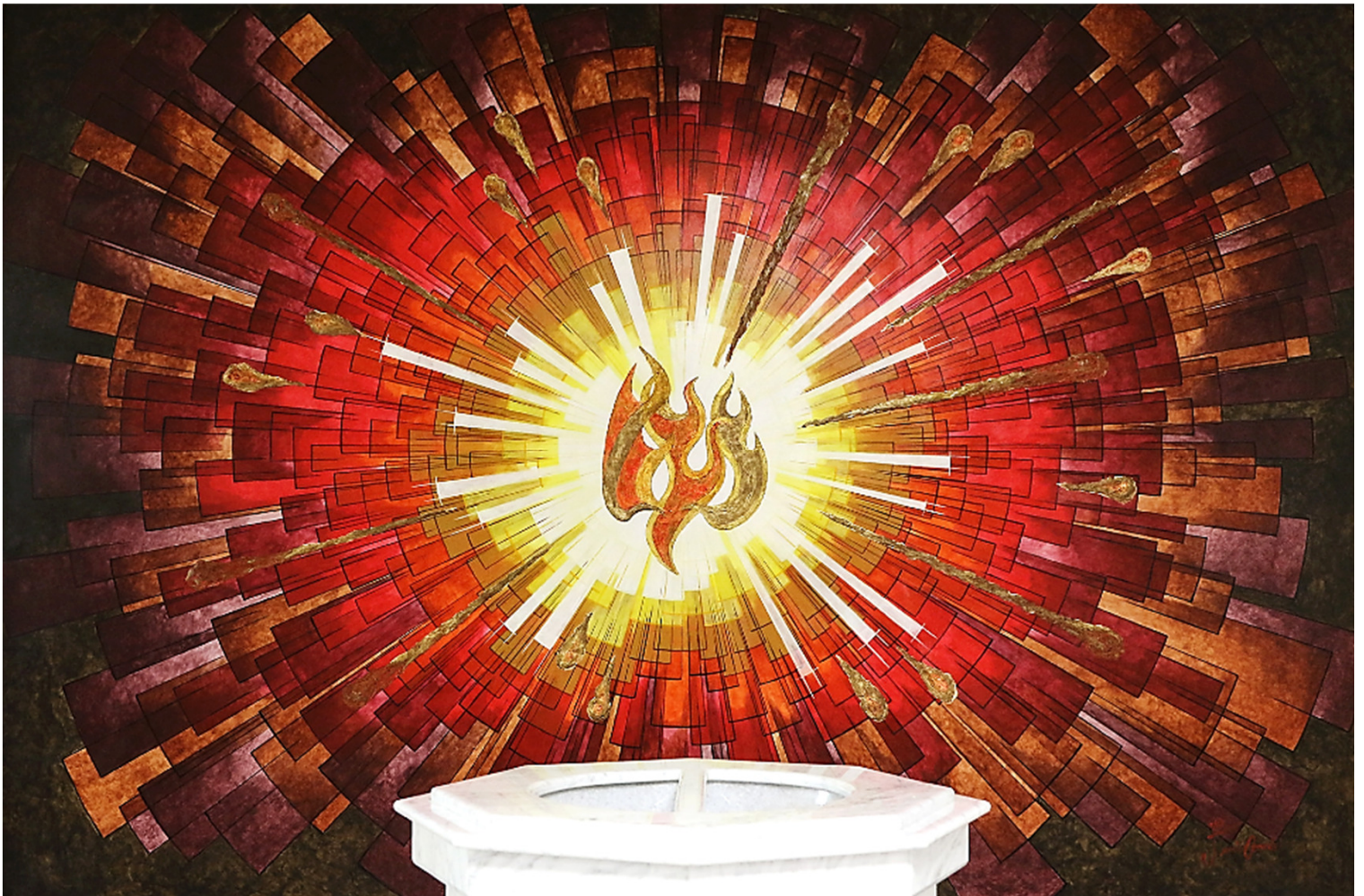
The Holy Spirit and Fire with Baptismal Font -- Church in Mexicali, Mexico

The time ends with the sound of a singing bowl.