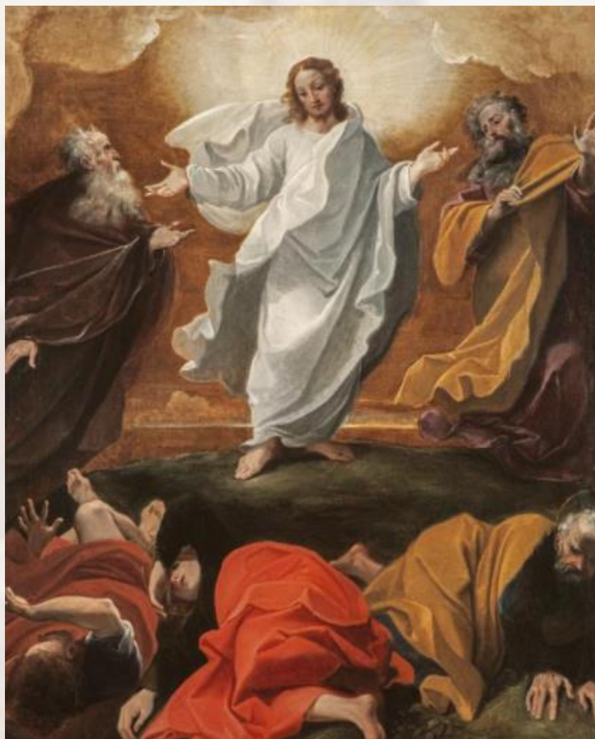
"The Transfiguration" by Ludovico Carracci, National Galleries of Scotland

Extra seasonal resources developed by Roots on the Web