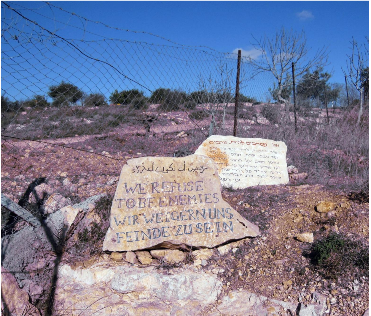
Near the 'Tent of Nations' in Bethlehem