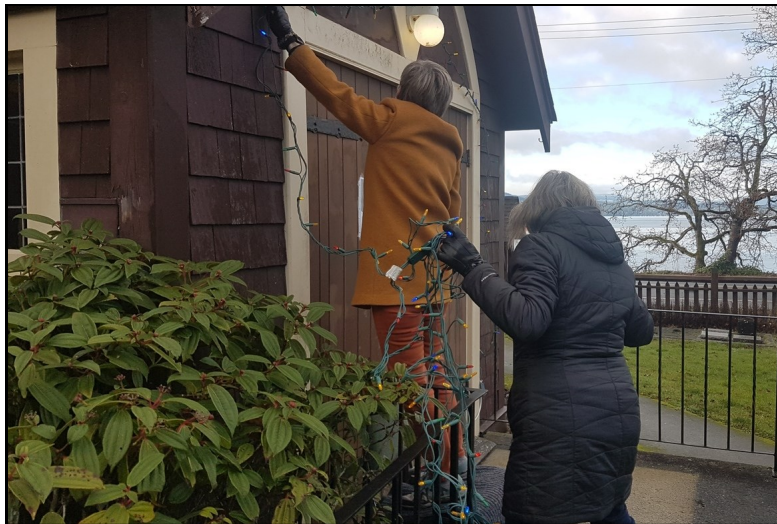
Two of the “elves” busy at work decorating the entrance of the church. They also strung lights along the walkway and in one of the trees.