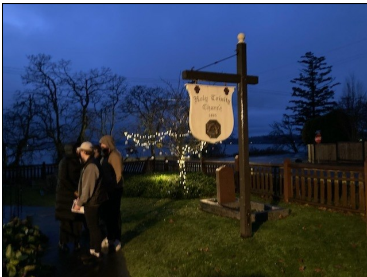
The lights were a pleasant surprise greeting parisioners on Christmas Eve.