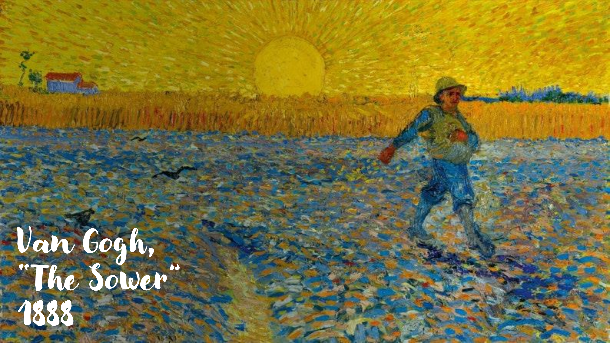
Van Gogh, "The Sower" 1888