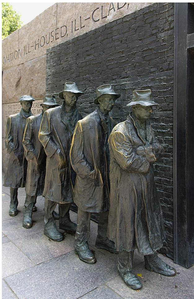
"Bread Line," sculpture by George Segal, 1991 at the Franklin Delano Roosevelt Memorial, Washington, DC

The 6 th Sunday after Epiphany A Service of the Word