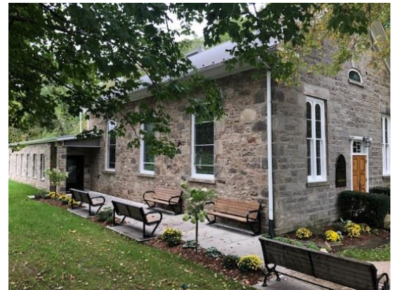
Heritage Room Entrance