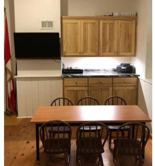
Sunday School area in Fellowship Room